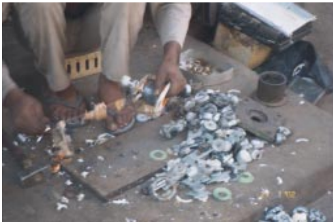
Dismantling Circuit boards

The printed circuit boards contain heavy metals such as antimony, gold, silver, chromium, zinc, lead, tin and Copper. According to some estimates, there is hardly any other product for which the sum of the environmental impacts for raw material, industrial refining and production, use and disposal is so extensive as for printed circuit boards. 2 The methods of salvaging material from circuit boards are highly destructive and harmful as they involve heating and open burning for the extraction of metals. Even after such harmful methods are used, only a few of the materials are recovered.