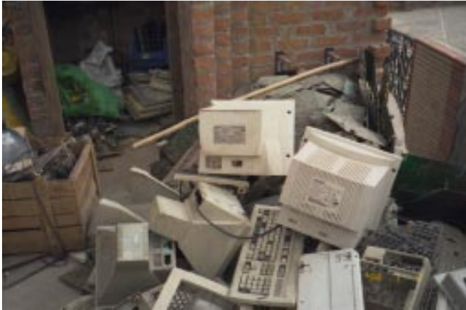
Waiting to be recycled