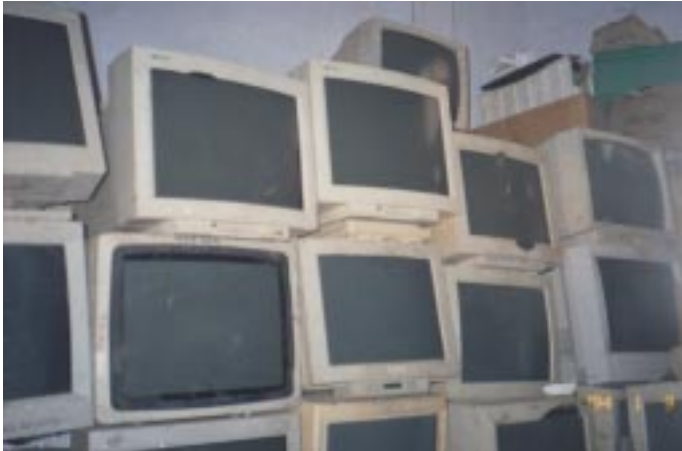
Monitors being stacked for disposal