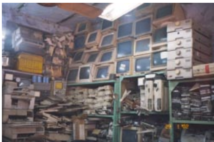
Computer waste generated from an office in Delhi

9,60,000 are 486s, and 5,20,000 are 386s and 286s. If we calculate in terms of weight, it comes to around 4,14,000 tonnes.