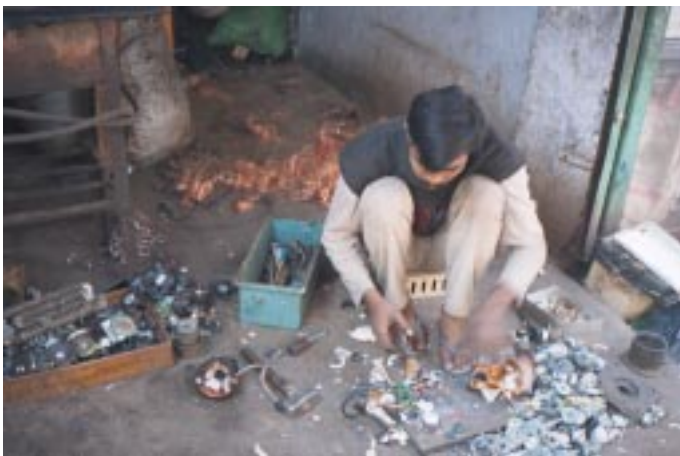
E-waste: Scrap dealers source of livelihood

Immediately after securing computers from various sources, scrap dealers face the dilemma of deciding which computer ought to be dismantled and which to be retained for resale. This dilemma arises because only a few models are in demand as second hand products. Once the decision is made, the not-to-be-resold computer components find their way to the storehouses for dismantling. Sometimes, even a computer meant for direct reuse may ultimately end up in the storehouse as dealers cannot wait long for a prospective buyer.