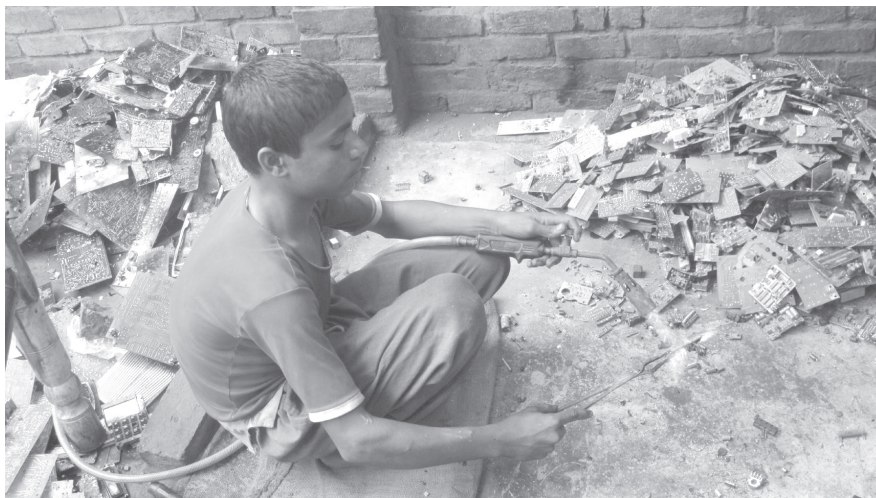
A teenager burns the Printed Circuit Boards

E-waste recycling in India, till a few years back, was concentrated in large cities like Delhi, Mumbai, Bangalore, Chennai and Kolkata. But with the increase in the genera-