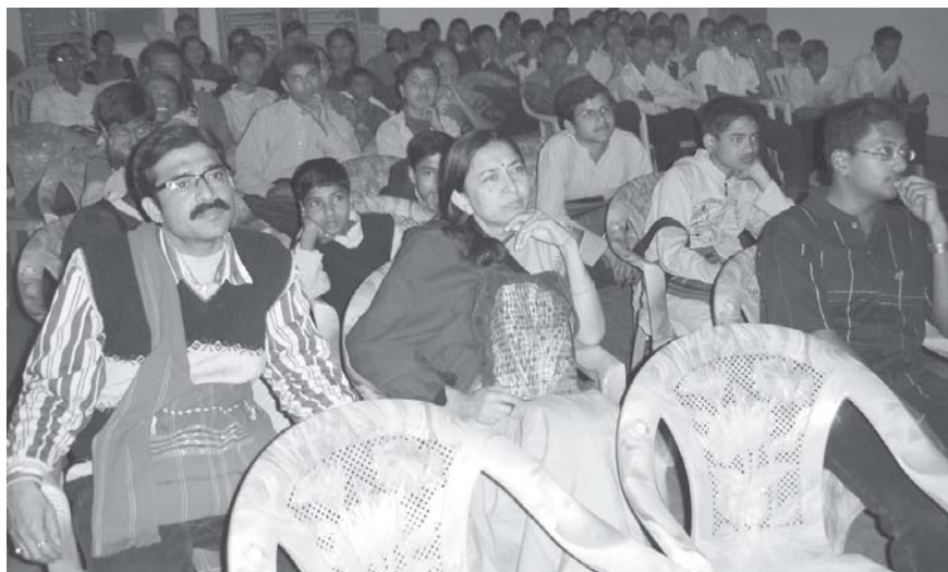
Enthralled audience at the festival