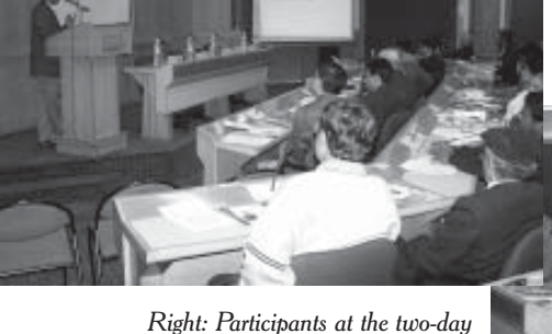
Right: Participants at the two-day national workshop.