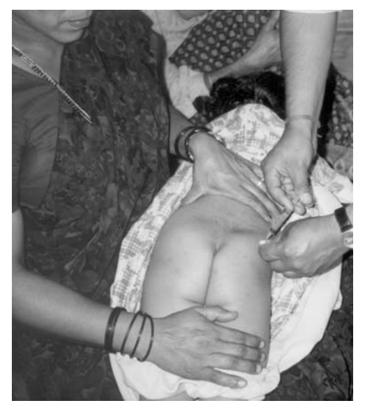
Immunisation drives lead to a large quantity of biomedical waste being generated.

According to the Health Ministry, the study had four main aims: to assess the frequency of injections in India; to determine what proportion was unsafe; what proportion was not required; and what determined the use of injections in the country. "The methodology used was a population-based survey and a health facilities-based survey", said an official. Unsafe injections were