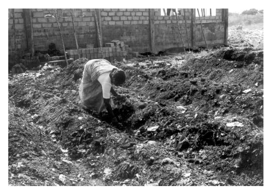
Manure being prepared from the organic waste.

the discussions. The link between solid waste management and household well-being was reiterated by illustrating reduction in household expenditure on medical services emanating from better management of solid waste and resulting in lower incidence of communicable diseases.