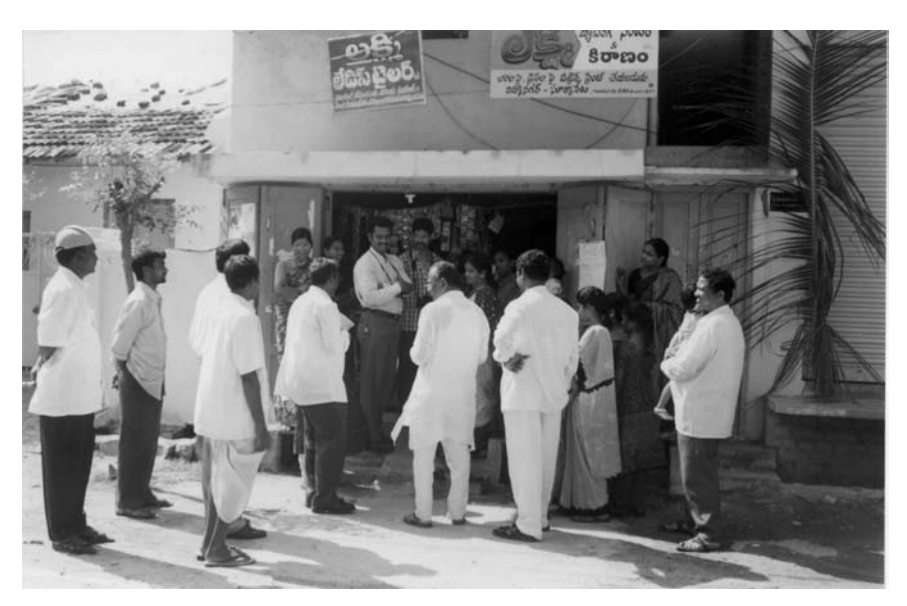
Door to door mobilisation by a team of municipal staff and ward councillors.

The street meetings combined the topof-the-mind civic problems of the citizens with the benefits of waste segregation at source. The meetings would typically discuss issues including the right age for marriage, compulsory education, importance of adult education, reasons for the spread of communicable diseases, implementation of RCH programmes, problems of child labour, etc. While the lead issues were used to gain the attention, the benefits of source segregation of solid waste was factored into