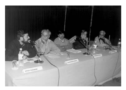
The panel discussion on 'Repression'.

January 23 focused on the issue of 'Hunger' through films questioning food safety and food security. The impact of the heavy use of pesticides on Indian agriculture, particularly on small farmers and the threat represented by biotechnologies, was one crucial theme. This included films such as 'Seeds of Plenty, Seeds of Sorrow', by