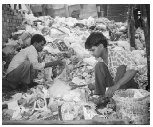
Ragpickers segregating plastic waste.

The plan was born in response to the report of a government task force which found that India's per capita use of polymers is very low in comparison to the developed countries, even China. For the record, at present India's per capita use of plastics is 3.6 kg, whereas in China and the rest of the world it is 16.4 kg and 24.6 kg respectively. In order to catch up with the world, the government, in its wisdom, plans to increase our per capita use of plastics to 12 kg by 2010.