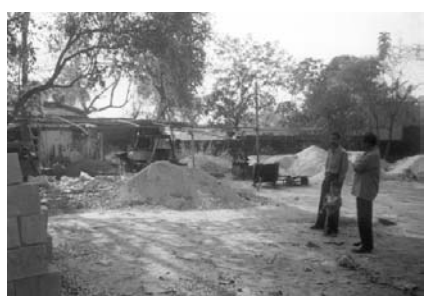
A fly ash brick manufacturing unit.

The Hindu, January 30, 2004: Following an order passed by the Union Ministry of Environment and Forests, it is now mandatory for clay brick, tile and block manufacturing units within a 100 kilometre radius of a thermal power plant to mix at least 25 per cent ash by weight with the clay in the manufacturing process. The order comes into force immediately for units within a 50 kilometre radius of thermal power plants.