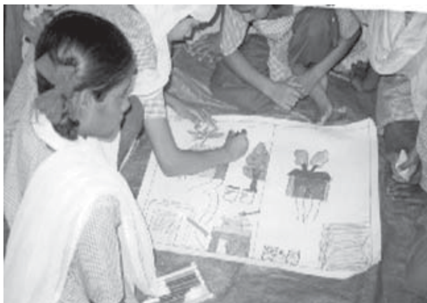
Children preparing posters on waste management.