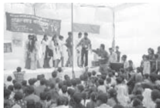
A community meeting in progress.

Presently, door-to-door collection is happening four days a week and remaining two days of the week are spent for cleaning of street drains. This has greatly helped in avoiding the unhygienic and unsanitary condition in the area and increased community participation in the programme as well. Every household is charged rupees 10 per month as a user fee. The monthly revenue generation through this contributes to the monthly salary of the workers sustaining livelihood of the four local families. The pro-